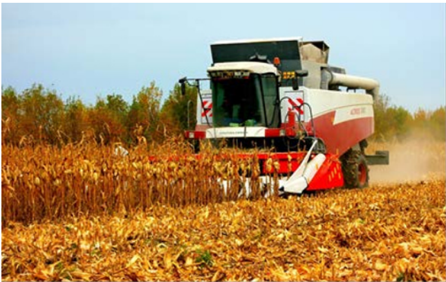
Fig. 2. Corn harvester "CornMaster 8" in the unit with the ACROS 580 combine.

Table 1 shows that the size and number of weeds in the herbicide-free version is greater than in other areas. Among weeds, dicotyledonous plants dominated, mainly tilted schiritsa (amaranth), and spreading quinoa, which were 1.5-2 times more than cereals (setaria glauca). Corn harvesting in the studied areas was carried out with a grain harvester ACROS 580 (Fig. 2).