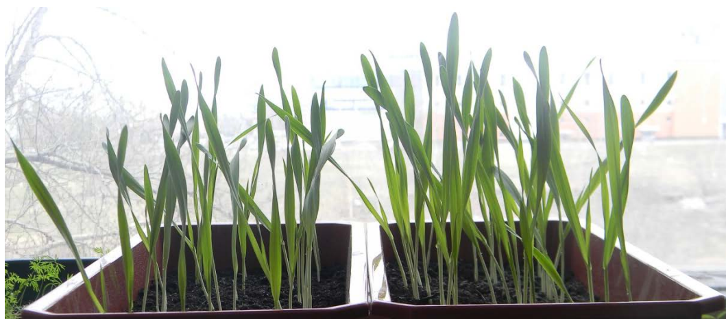
Fig. 2. Seed emergence 7 days.

Figure 2 shows the sprouts of barley after 7 days after planting.