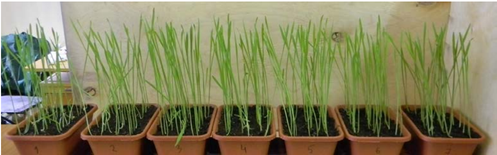
Fig. 3. Seeds germination 7 days after planting

Figure 3 shows wheat germ after 7 days after planting.