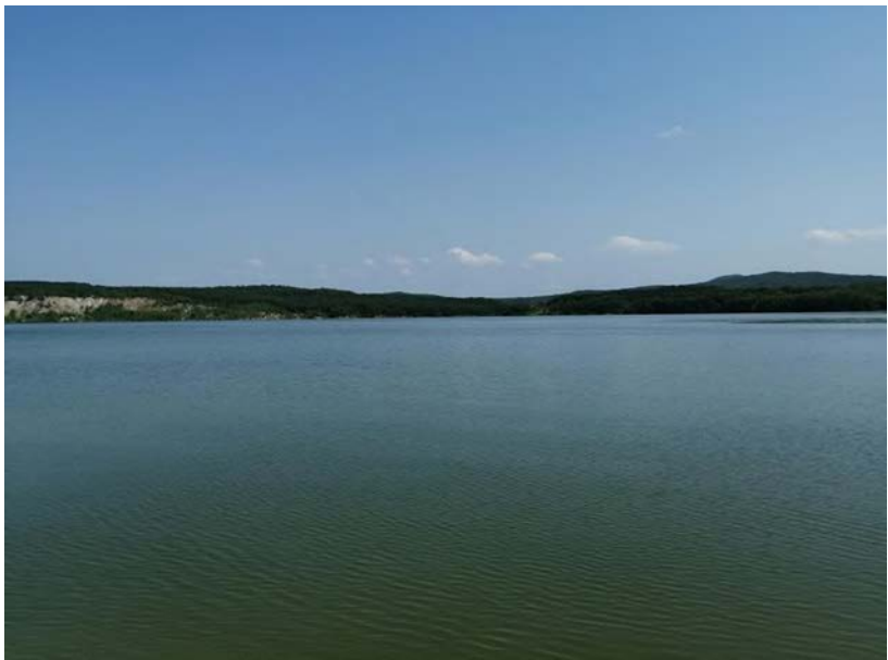
Fig. 1. The current status of the reservoir of the Rettihovskiy quarry (2019)