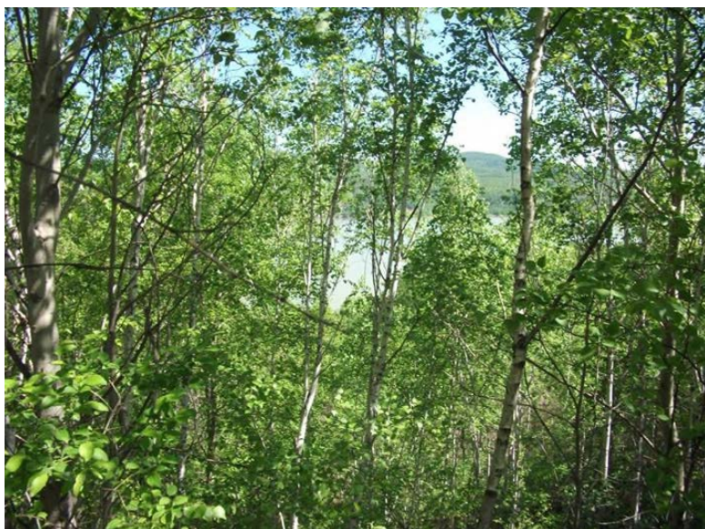
Fig. 3. Formation of a closed stand in areas of self-growth.

The emergence of new species: Padus maackii (Rupr.) Kom., Alnus hirsuta Turcz., Ulmus laciniata (Trautv.) Mayr, Fraxinus mandshurica Rupr., Maackia amurensis Rupr. et Maxim., Acer tegmentosum Maxim., Kalopanax septemlobum (Thunb.) Koidz has been noted. New species also appeared in the shrub layer. – Aser mono Maxim., A. ginnala Maxim., Corylus heterophylla Fish., Euonymus pauciflora Maxim. Earlier shrubs were represented only by Salix caprea L. and Sorbaria sorbifolia (L.) A. Br.