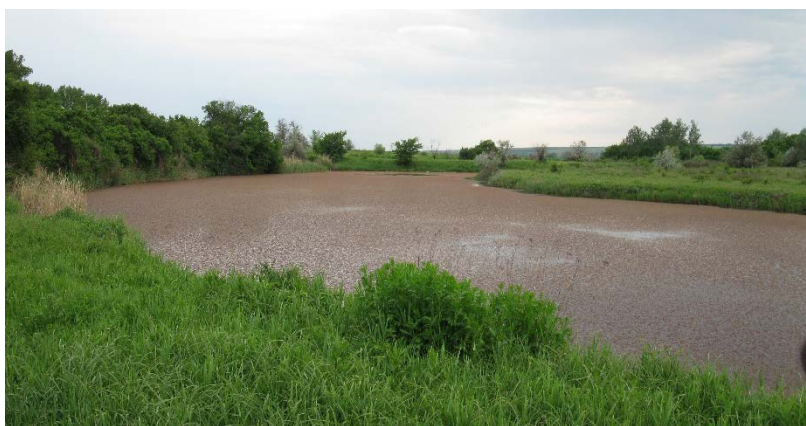
Fig. 1. Pollution of the Kadamovka River

On the territory of the Eastern Donbass, after the closure of mines, the flooding of rock mass began, which required arrangement of dewatering to prevent flooding of residential areas. For this, in the City of Shakhty, on the territory of former mines, three sections had been created for pumping underground water from old mine workings. The volume of pumped water in the section of Glubokaya mine reached 930 m 3 /hour, and the wastewater consumption of the entire city was 750 - 920 m 3 /hour. With a dry residue of up to 9 kg in 1 m 3 of groundwater, the iron content reached 0.3 kg. Since old treatment facilities were designed for a much lower water consumption, at the initial stage of the drainage operation, pollution of the Kadamovka River was catastrophic (Fig. 1).