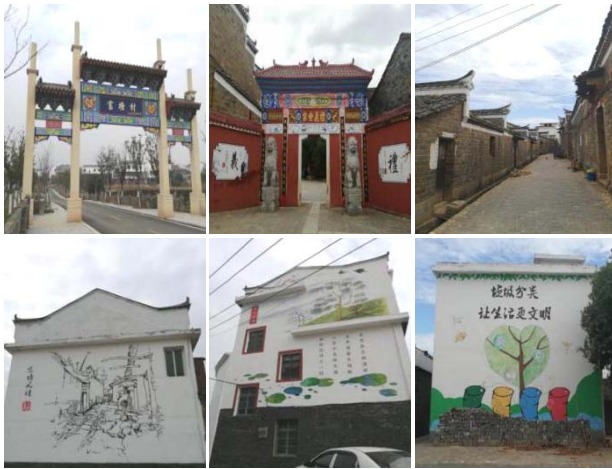
Fig. 2. Updated views of Futang Village.

the villages look the same. If we excavate characteristic culture too shallow, internally it's hard to establish the villagers' cultural confidence, and externally the village seems lacking in its own features.