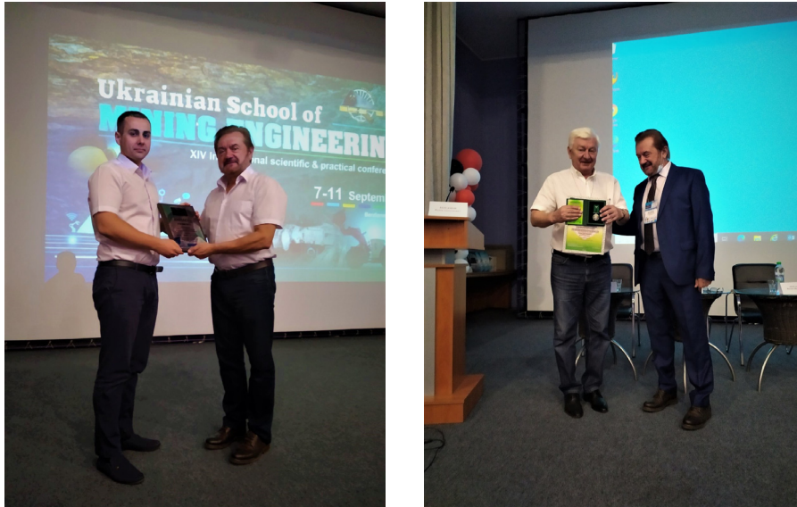
Fig. 4. Award ceremony for conference participants.