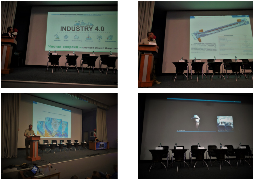
Fig. 3. Presentations of participants.

After each panel discussion, conference participants were invited to make their presentations (Fig. 3). A large number of innovative approaches to solving urgent problems of the mining industry were noted. Each report was actively discussed, and the most relevant proposals were adopted. The main topics that were highlighted in the presentations were the following: monitoring and diagnostics of coal face systems operation; mining in the twenty-first century and its world of work; considerations for universities offering mining qualifications; processing of rock dumps; innovative systems of automatic maintenance of the roof of the stoping face; difficulties in maintaining shaft lining – testing methods and repair methods; development of technological schemes for open-pit mining of deposits using “mobile crushing-reloading-conveyor complexes”; phenomenological model of an open-type geothermal system on the basis of oil-and-gas well; geomechanics of overworked mine working support resistance in the laminal massif of soft rocks; methane gas hydrates influence on sudden coal and gas outbursts during underground mining of coal deposits; and others.