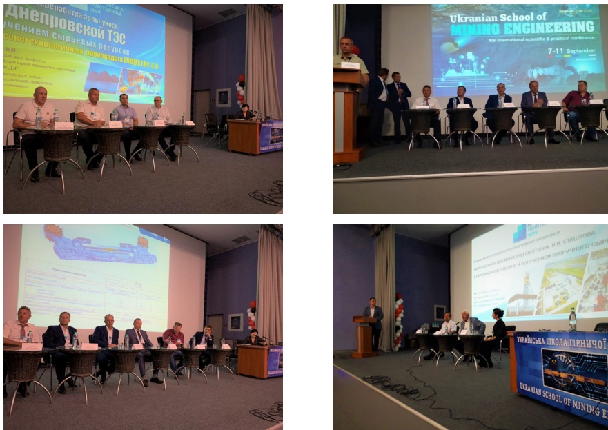
Fig. 2. Panel discussions that were held during the conference.