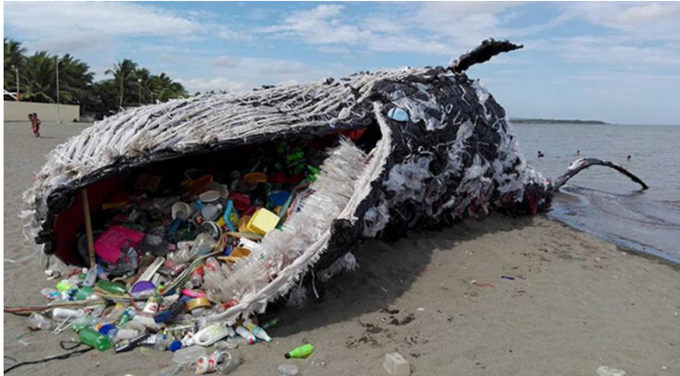
Figure 1 A whale made of plastic waste and stuffed with plastic waste