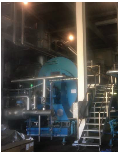
Fig.3 Haarslev driers