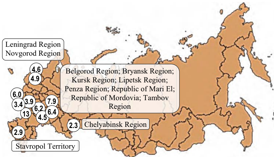
Fig. 3. Map 2017: Russian regions with localization coefficients above 2.0 (were calculated according to the indicator “poultry growths (live weight), in agricultural organizations”, in proportion to the average annual number of employees).

The largest concentration in the meat pig sector is located in the central regions of the European part of Russia. The second largest territory is the regions of the North-West of the country. The analysis revealed two trends.