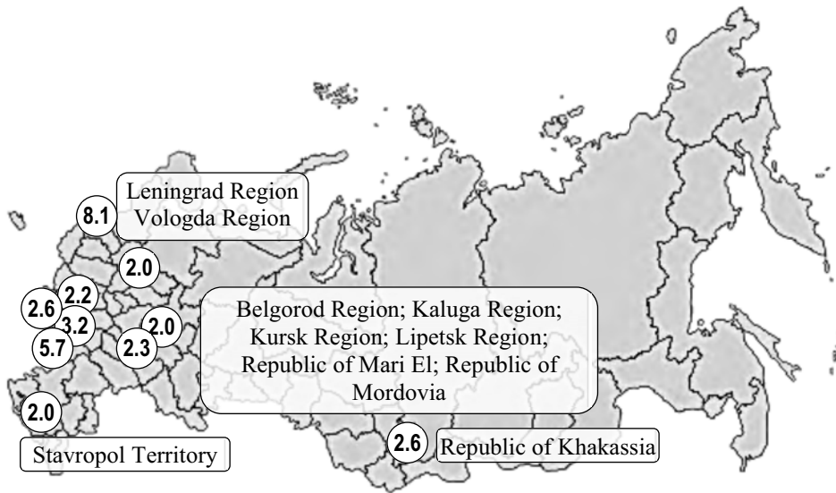
Fig. 2. Map 2004: Russian regions with localization coefficients above 2.0 (were calculated according to the indicator “poultry growths (live weight), in agricultural organizations”, in proportion to the average annual number of employees).