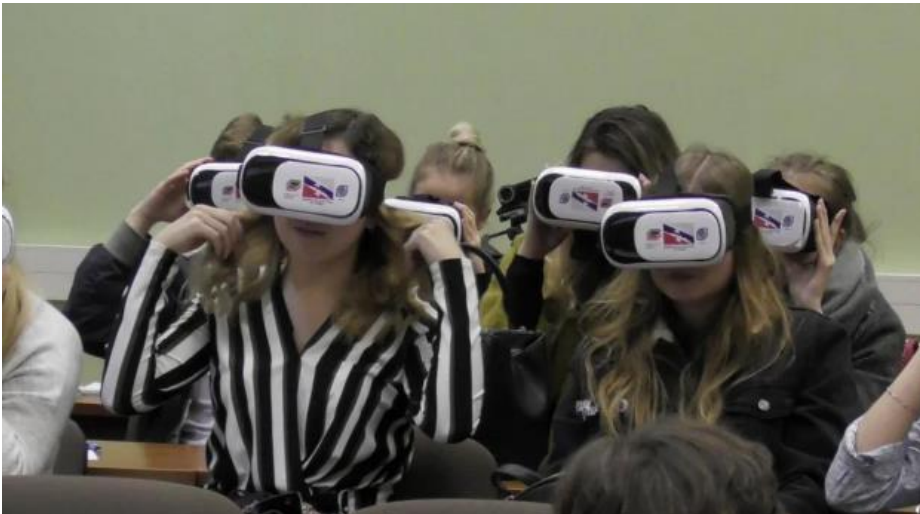
Fig. 3. Approbation of an electronic textbook using virtual reality glasses.

The subjects in the face-to-face lesson using the electronic training manual had to go through the entire virtual hotel, listening to video inserts describing the problems of each marked point.