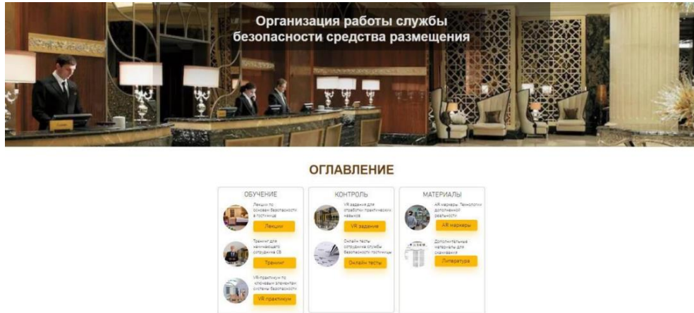
Fig. 1. The main page of the electronic textbook.

innovative sections - a section of virtual reality (VR) and a section of augmented reality (AR) (Fig.1).