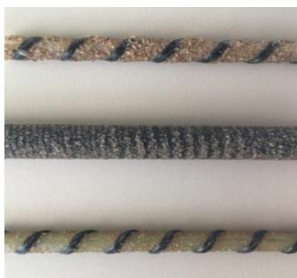
Fig. 2. Samples of composite construction reinforcement with a layer of mineral particles applied to the surface.

From the values presented in Table 2, it can be seen that the coils of the reinforcement braid work for shear and crush not efficiently and provide mainly technological strength, preventing the bar from delamination at the stage of reinforcement manufacturing. It is advisable for increasing the efficiency to make in accordance with the accumulated experience, a rough surface with the application of silicate particles, which contribute to strengthening the setting of concrete with the surface of the reinforcement (Fig. 2.)