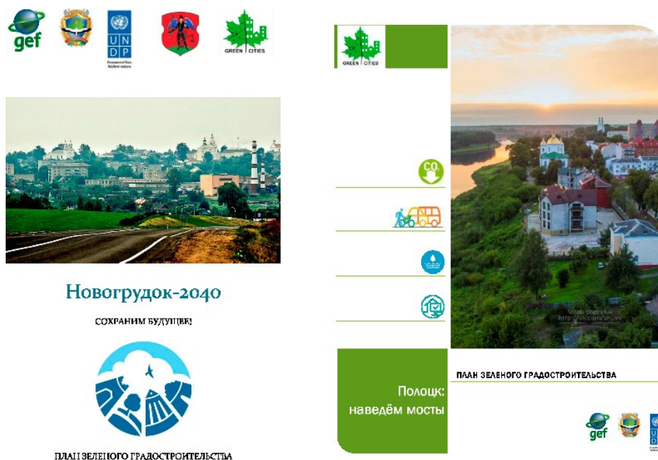
Fig. 1. Plans for green urban development in Polotsk and Novogrudok [4]

For a set of actions for the implementation of urban development priorities for each of the cities a system of complex indicators has been assembled with their subsequent monitoring. The consistent implementation of the Green Urban Planning presupposes targeted interventions in the most problematic or, on the contrary, prepared areas of the city to launch its green development, therefore such points of growth and pilot development projects were identified in cities [4].