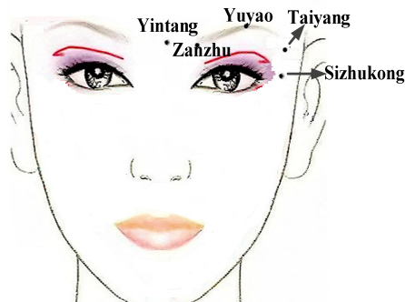
Fig1. Facial scraping acupoints

Mild fever, headache, insomnia and other symptoms are more obvious, head scraping and acupoint massage can significantly alleviate the related symptoms of patients. Its operation essentials are: firstly the nurse uses 40 degrees warm water to wipe the patients' head and face, then chooses buffalo horn scraping board. Scraping is carried out from top to bottom, from front to back. The first line is facial scraping, starting from Yintang acupoint, to Zanzhu, Yuyao, Sizhukong to Taiyang, each side scraping 20~30 times, the acupoints have been shown in Fig.1. After wiping the head, combing the du pulse, left and right bladder meridians, from the forehead to the back side of head 10 times each; then wiping the head on both sides, from the forehead to the back, 20~30 times each side. Then Baihui Yu as the center, radiate to the whole head, 20~30 times on both sides; finally point the Taiyang, Fengchi, Fengfu 10 times each[7].