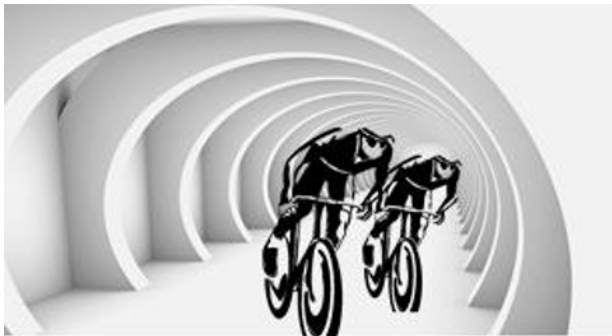
Fig. 3. The "cyclist – heat-insulated bike path" system's positive synergistic effect.

Using the townspeople warmth. Each person emits heat energy of the order of 100...120 W when sitting at rest, 150...220 W when moving and when working lightly, 300...430 W when walking fast and doing active physical activity. With a large crowd of moving people, you can get quite a large amount of thermal energy, if you do not disperse it into the atmosphere (figure 3).