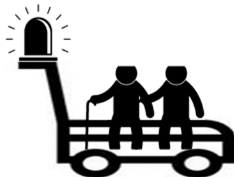
Fig. 5. The "police robot – cleaning robot – transport robot" system's positive synergistic effect.

Synergistic effect of combining several city services. For example, a city streets cleaning robot can additionally act as an observer to assist police, non-urgent transportation of objects and citizens with limited mobility (Figure 5).