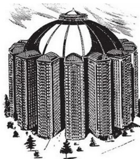
Fig. 1. Abram Ioffe's project of the building-city.

The story of increasing energy efficiency in cities probably begins with King Gillette's book «The Human Drift», published back in 1894, in which he proposed the idea of the «Metropolis» – house-city designed for a huge number of residents [3]. There are projects of similar buildings-cities in the USSR, for example, the project of a house for a million inhabitants from academician Abram Ioffe (fig.1). For a number of reasons, these projects are utopian, being dependent on the risks of fire or, for example, an earthquake. In addition, humanity is not yet ready to completely relocate to this kind of city-building.