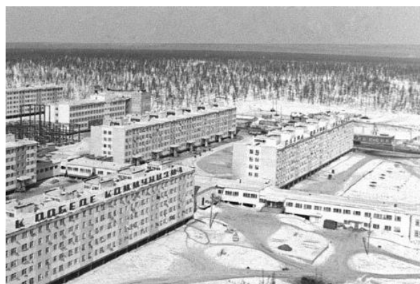
Fig. 2. The covered gallery in Udachny city (Yakutia).

There are also known Soviet projects of Arctic cities in the middle of the XX century, one of which partially realized in Udachny town in Yakutia (fig. 2).