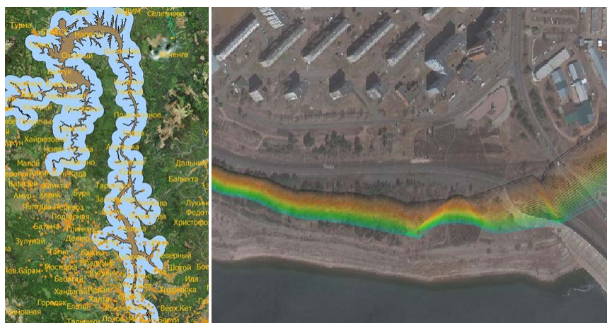
Fig. 3. The Bratsk Reservoir and a fragment of the Bratsk city.

Based on the technique described above, we developed digital elevation models of the Irkutsk, Bratsk and Ust-Ilimsk reservoirs (Figs 2-4), including the zones of possible flooding (in the form of contour lines) under various scenarios of the water content. Based on this technique, we generated an electronic map of the coastline (buffer zone from 4 to 10 km) and obtained a digital album for the Angara River within the Irkutsk Region. We processed 103 settlements within the Irkutsk Region and constructed contour lines with flooding threat levels for each of them.