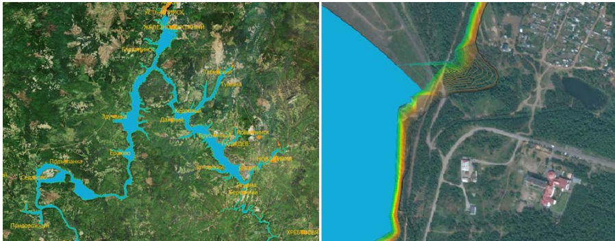
Fig. 4. The Ust-Ilimsk Reservoir and the fragment of the Ust-Ilimsk town.

In conditions of elevated and extremely high influx to Lake Baikal, taking into account the current rules for regulating water levels in the lake, there are high risks of flooding in the downstream of Irkutsk HPS. To assess the possible damage, we have developed a technique for modelling the channel of the Angara River as well as special software components that allow us to investigate flooding zones at various discharges through HPS.