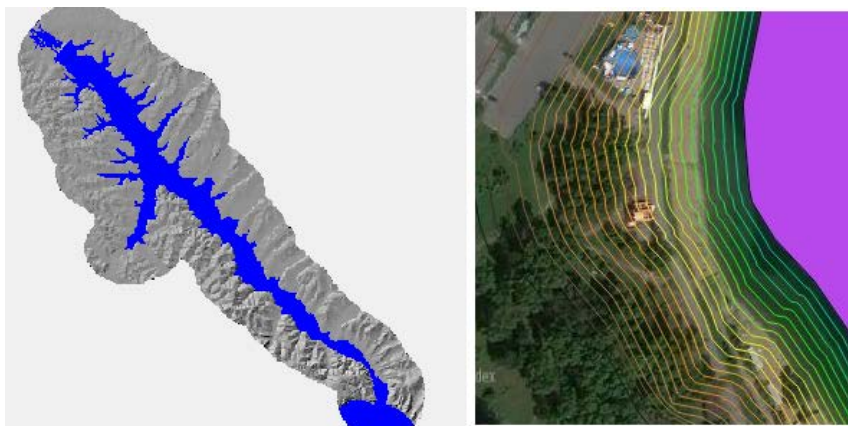
Fig. 2. Triangulation for a given area and an example of possible flooding under various scenarios of the water content (the Irkutsk Reservoir). Contour lines are plotted every 20 cm.

Based on the modelling various scenarios of water level rise using the QGIS standard methods, we obtained an album with maps of the settlements (103 objects) that are subject to flooding. A map with contour lines was generated for the level rise of up to 5 m and contour lines every 20 cm (Figs 2-4). An expert assessment of the risks of the possible flooding was carried out for each settlement.