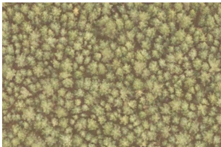
Fig 3. Arrangement of trees on the test plot: top view of the pine stand.

competition for available resources [5]. The result of such competition on the test site is shown in Fig. 3.