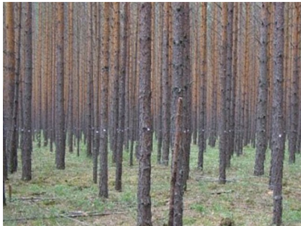
Fig 2. Arrangement of trees on the test plot: the structure of the trunk layer.

This criterion is met by a even-aged pine stand based (test site) in the Pogorelsky Bor, territorially part of the Krasnoyarsk sporadic forest-steppe. The pine forest at the age of 55 is represented by a highly productive tree stand of the 1st quality class. The spatial distribution of trees on the site is uniform, without glades and pronounced tree biogroups. Undergrowth, undergrowth and dwarf shrub layer are absent (Fig. 2).