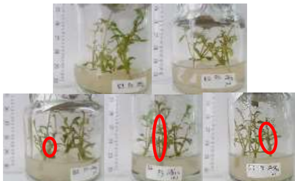
Fig. 1. Growth of Stevia shoots cultivated in a solid medium with different concentrations of PGRs: (A) 1 mg kg -1 Kinetin, (B) 2 mg kg -1 Kinetin, (C) 0.5 mg kg -1 BAP, (D) 0.6 mg kg -1 BAP, and (E) 0.7 mg kg -1 BAP.

The result of the initiation process showed that 70 shoots meristem (either apical shoots or lateral shoots) could proliferate into 243 shoots with 89.74 % percentage of success. Multiplication percentage of initiation reached 352.86 %, or in other words, one explant could proliferate into three new shoots. The subculture phase showed that 247 shoots could proliferate into 610 shoots with a success rate of 98.34 %. Multiplication percentage of subculture was 246.96 %, or in other words, an average of one shoot could proliferate into two new shoots. These shoots were then acclimatized in thin layer culture.