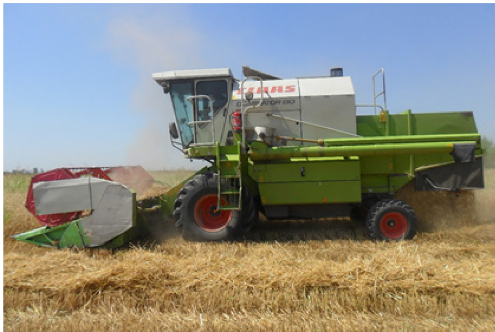
Fig. 2. Experimental cereal combine

Above mentioned Han and others developed method to evaluate auto guidance systems of linear parallel-tracking applications of agricultural machines that equipped with GNSS devices [11]. Keskin used an automatic agricultural vehicle based on low cost GPS receiver for increasing the rate of them [12]. Coen developed a robot combine harvester as the aim more realizing GIS technologies during the harvesting works [13].