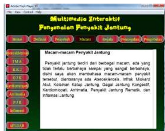
Fig. 6. Sort menu page view.

In the scene of various heart diseases it contains various sub menus contained in the application. The menu page of various heart disease is the fifth scene that users will encounter when running this application consisting of eight sub menus including: atherosclerosis, IMA, KJJ, GKJ, cardiomyopathy, arritmia, PJR, Inflammation. The following is a view of the menu page of various heart diseases from cardiovascular detection using interactive multimedia with rich internet application method. Various diseases are taken from references 4.