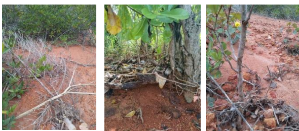
Figure 2. Mangroves condition at Sungai Karang and Senggarang which left picture is broken of stems; the middle picture is the change of leaves color and the right picture is the dead of roots.

The cause is thought to be due to the activities of local residents entering the mangrove forest area, winds that are too strong, or weathering. In addition, the condition of damaged leaves was found as much as 20% and leaves that changed color as much as 14%. Symptoms that can be seen are leaf chlorosis (lack of green matter) such as turning yellow or brown, brown or black spots, and withered leaves [5]. stated that the symptoms of leaf damage can be caused by the absence of chlorophyll formation due to the presence of pathogens, toxins, excess chemicals, or burning by temperatures that are too high.