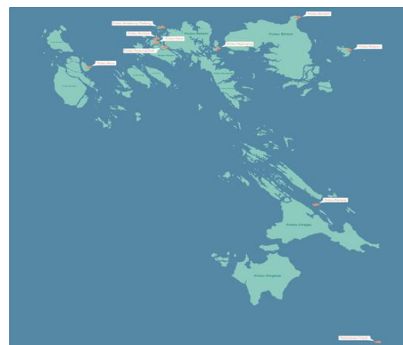
Figure 1. Fishing destination of Sampan Tribe

The Sampan tribe navigates the archipelago by following the tides and currents of the sea, winds, fishing grounds, sun positions, moon, and stars, about which they have extraordinary knowledge. These patterns are adopted until today. It is surprising why they can know which areas are abundant in fish. At the same time, they are not equipped with the latest and adequate technology or information. Based on interviews with several people from the Sampan tribe, they know the information from 'nature whisper.' Most of the Sampan tribe do the same thing, and they can meet in the same location simultaneously. There are ten areas that are fishing destinations for the Sampan tribe such as Berakit island, Mapur island, Belakang Padang island, Ngenang island, Bertam island, Gara island, Buru island, Tudjuh archipelgo, Tanjung kub, and Berang island and it can be seen in figure 1.