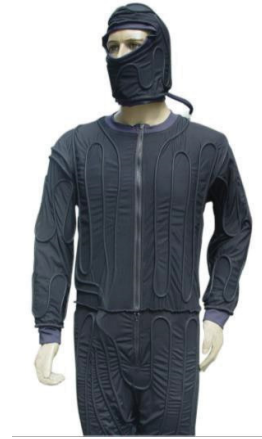
Fig. 4. Water cooling suit