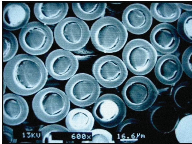
Fig. 1. Polyester fibres with PCM (courtesy of ©Outlast Technologies GmbH)

Frozen gels, paraffin and salts are mainly used as phase-change materials. For cooling, they are used in their frozen state and have efficiency until the respective material melts. PCMs have a number that indicates the material's melting temperature: i.e. PCM5, PCM10, PCM 15 [16]. Figure 1 shows a microscope view of polyester fibres with incorporated PCM (courtesy of ©Outlast Technologies GmbH).