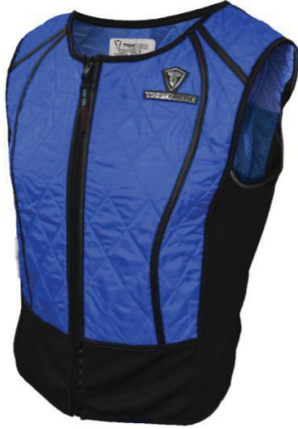
Fig. 3. Evaporative cooling vest

of highly elastic textile materials, making it comfortable to wear without affecting human motions [15].