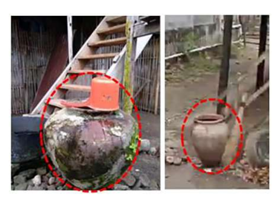
Fig. 3. Traditional Hand-Washing of Buginese (Bempa).

The philosophy of "Bempa" or water barrel in front of the Buginese house is one of the efforts in maintaining the cleanliness of the house and occupant's health. In the past, Bempa were always placed near the stairs of the Buginese house (Fig. 3) and everyone who would go up to the house (house on stilts) had to first wash their feet and hands to clean them from all dirt and sources of disease. This is an innovation of the Bugis society according to their level of understanding at that time in maintaining cleanliness to avoid disease. In addition, at the front or side of the Buginese house in the past, there was a well or water reservoir and a bathroom so that every occupant comes home from the garden or workplace they were always cleaned their body or takes a shower before entering the house.