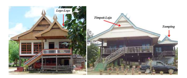
Fig. 2. Traditional Buginese House.

In addition, generally Buginese houses have additional room, namely (1) Lego-Lego is a room in front of the main house that functions as a lounge room or terrace room with a roof model that is similar to the roof of the main house in a smaller size. (2) Dapureng is a kitchen room, which located behind or beside the rear of the main building (Fig. 2). It is equipped with a ladder in front of the dapureng for easy accessibility. On Buginese house, there are parts of the house that contain sacred meanings, namely "Possi bola" and "Timpak laja". Possi bola is the central pillar in the center of the house as a source of "sumange" or spirit for residents, as a symbol of "harmony and blessings" in life. The level of the timpak laja symbolizes the social stratification of the occupants namely: 5 levels for the king's palace, 4 levels for nobles or former kings, 3 levels for descendants of nobility, 2 levels for the general public, and 1 level for slaves [27].