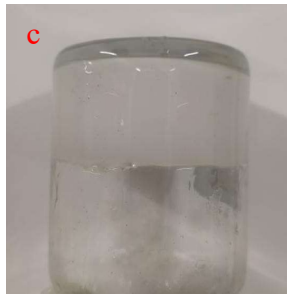
Figure 1 The gel-forming morphology of systems with initiator systems: (a) ammonium persulfate, (b) sodium sulfite, (c) ammonium persulfate-sodium sulfite

Ammonium persulfate ((NH 4 ) 2 SO 4 ) is an inorganic oxidizing initiator, which is used for aqueous solution polymerization and emulsion polymerization. When the temperature is higher than 60 °C, ammonium persulfate may decompose effectively, and the decomposition product is free radical, which can effectively initiate the polymerization reaction. Sodium sulfite (Na 2 SO 3 ) is usually used as a reducing initiator. According to the experimental data in Table 2, when ammonium persulfate was used as initiator, the gelation time of the reaction system was longer, which was 4 hours, and the strength reached grade I. When the initiator was sodium sulfite, the reaction system was basically not gelled. When ammonium persulfate sodium sulfite was used as initiator, the gelation time of the reaction system was 2 hours, the gelling time was appropriate and the strength was excellent. Therefore, ammonium persulfate- sodium sulfite was used as initiator for subsequent experiments.