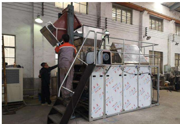
Figure 2. Experimental apparatus.