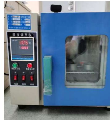
Figure 3. Electric heating constant temperature drying oven.