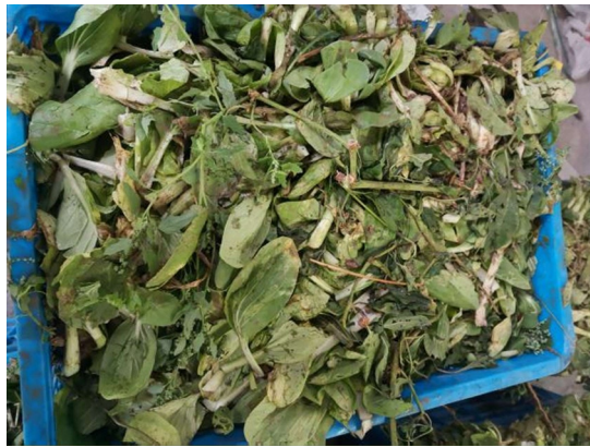
Figure 1. Experimental raw material.