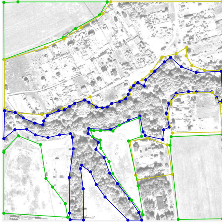
Fig. 3. Example of a marked-up snapshot.

An example of the markup of one of the frames shown in Figure 3.