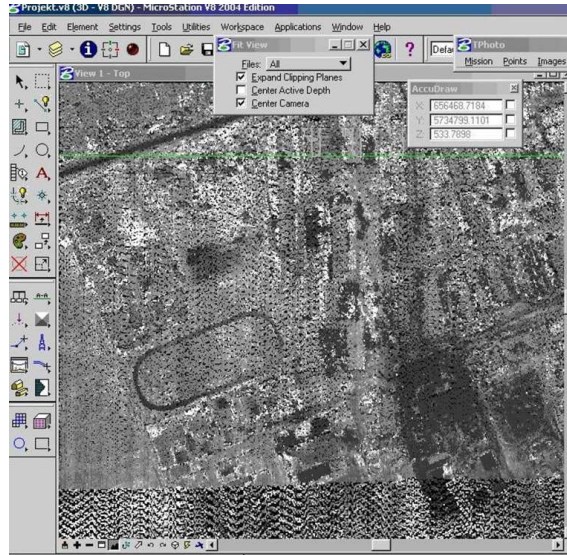
Fig. 2 - Airborne laser scanning processing data in PP Terra Solid

The next stage was building a digital elevation model and digital orthomosaic. As a result, a 3D hedgehog was created, and the accuracy was assessed by determining the points on the photographic image and the finished model, after which the affine transformation coefficients and the texture element coordinates were found. The result of evaluating the root-mean-square error accuracy is 0.33 m in elevation and 0.57 m in plane view. [5]