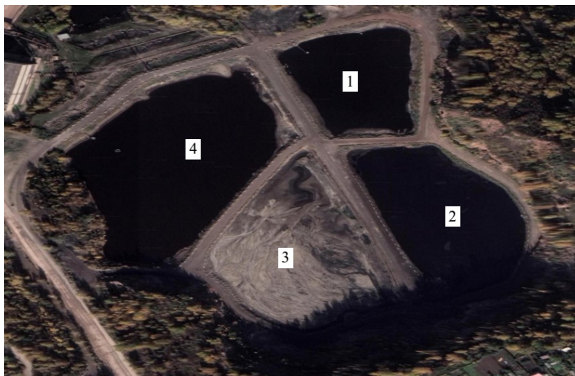
Fig. 2a. Results of ash dump No. 1 monitoring at the global stage

Global stage. The satellite image of ash dump No. 1 is processed in the SAS.Planet.Release.191221 program. The result is shown in Fig. 2a.