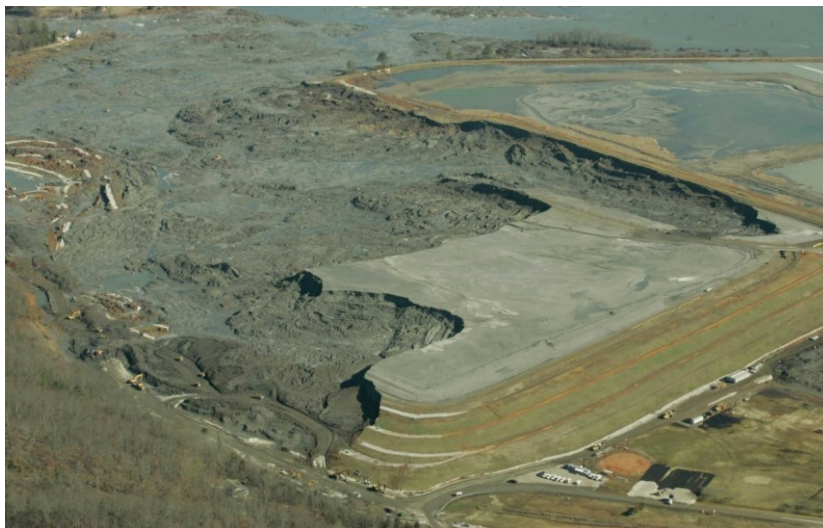
Fig. 1. Ash and slag waste outflow with contamination of the adjacent territory

Solution to this problem is possible through the use of a dry ash and slag waste storage technique with ash dump formation, which is rather difficult today due to the increased bureaucracy of TPP managing companies and, generally, does not solve the problem of monitoring the state of existing ash dumps. In this situation, increasing the ash dump monitoring efficiency comes to the fore, which relies on remote sensing technology, unmanned aerial vehicles and modern software for processing the observation results obtained. This will make it possible not only to increase the number of control operations, but also to improve the quality of the operation results for the purpose to develop an integrated TPP ash dump monitoring procedure in the climatic conditions of Siberia.