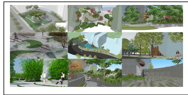
Figure 5. Landscape renderings display

Landscape design has been integrated into the overall design from the very beginning. This means that, architecture and landscape are self-contained. In the construction of landscape imagery, it has been considered that the courtyard has the potential to go further into abstract forms, which has resulted in putting people into imageries, where one can experience the ever-shifting perspective of mountains beyond mountains. Different from the individual-house-orientated design approach in the west, courtyards in this particular case are mostly a cluster, providing a fractal pattern of Unified Plurality. A hierarchy of the space therefore emerge from a fractal combination. Ultimately, imagery is rooted in "Tao Follows Nature" (Figure 5).