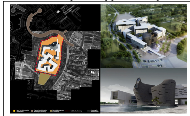
Figure 2. Plan of Innovation Pioneer Park of Wuhan University of Technology (upper left)

planned area is about 130 hectares totally. The building of Innovation Pioneer Centre of college students is nearly 34 meters high. And the construction area is about 38,700 square meters totally. The building's function is very complex, which is the most abundant and innovative building in the entire campus. The Innovation Pioneer Centre not only shows the new image of college students' innovation and entrepreneurship, but also marks the new development trend of China's higher education system. It aimed at creating a unique, functional, advanced innovation and entrepreneurship park for college students.