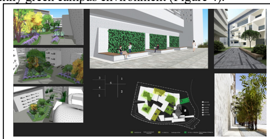
Figure 4. Landscape node explanation

The fashionable courtyard appearance implies the soul of Chinese traditional culture. Different formalized spaces shows the essence of Chinese traditional culture, with characteristics of "polymorphism". There are not only horizontal courtyards but also diagonal and vertical courtyards. Most of them deconstruct the traditional courtyard relationship and form a comfortable, quiet and healthy green campus environment (Figure 4).