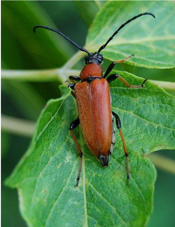
Fig. 3 Stictoleptura rubra , Red Longhorn Beetle [3]

The biggest issue of varmints in green wood is larvae eating their way through the wood in a hook-shaped path. Before pupating, larvae eat up to 1.5 inch horizontally into the heartwood and gnaw a 1 to 1.5 inches long vertical chrysalis chamber. These eating paths lead to a larger waste. Many wood-eating larvae of longhorn beetles harbor yeast fungi symbionts in their mid-gut that help them with the digestion of cellulose and hemi cellulose into sugar. The infestation of a tree by fungal pests is notifiable in some German federal states. An expert, who then determines remedial measures, must determine the infestation. A fungal infection is characterized by different destructive phenomena. White rot manifests itself in attacking the white matter, lignin. The local lignin degradation creates honeycomb holes in the wood and turns it white. Brown rot mainly occurs on coniferous wood. It destroys the cellulose of the wood, leaving the lignin, which then turns the wood dark. The wood is cracked, crumbly and eventually decays cube-shaped.