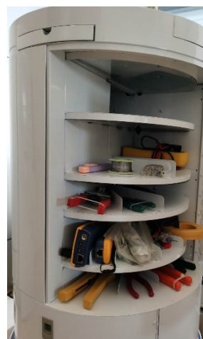
Fig. 2. Figure of Toolbox.

According to the classification of tools, the capacity of the tool box should be able to accommodate 5 types of tools, with a total number of 40 to 60 pieces. Therefore, the design of the tool cart structure is 5 floors, which store 5 types of tools, and each floor is divided into 2 rooms on the left and the right. The tool cart is a toolbox with 16 warehouses. Each warehouse is configured with hard-contact information acquisition card positions according to different tool shapes. The information of each tool storage warehouse is managed through a PLC module. Develop PLC module interface program. Provide relevant information for the management computer management software, and realize the management of the tool box by the management computer. The design of the toolbox and the card reader is shown in the figure 2&figure 3.