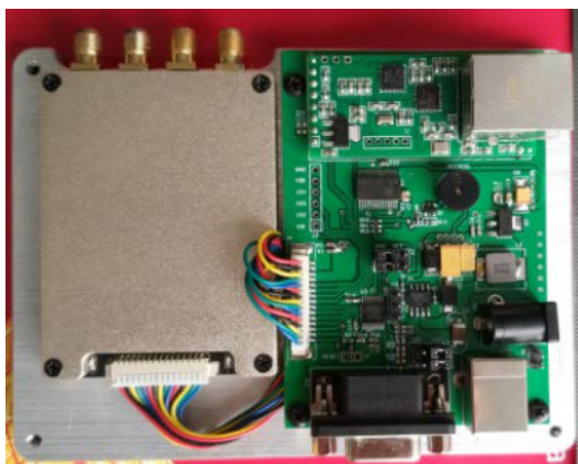
Fig. 3. Card reader.