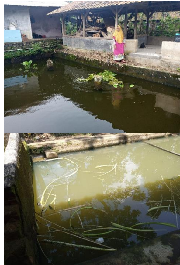
Figure 3. Suweg is used to fish feed in ponds

Especially in Sindangpanji Village, apart from jaburan , suweg is also used to feed fish such as gouramy ( Osphronemus goramy ) (Table 1). This is related to the large number of fish ponds in Sindangpanji Village compared to Cipulus Village and Cilancang Village, which have higher topographical positions and few water sources. The parts or organs of the suweg that are used for fish feed are the leaves and petioles that are generally still growing, not those that have withered. How to use it for fish feed is the strands and stalks of suweg leaves di-gebrus-keun (dropped) or di-alung-keun (thrown) into the fish pond (Figure 3).