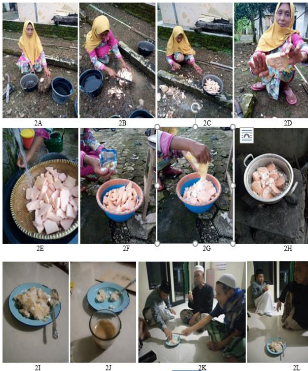
Figure 2. Seupan (steamed) of suweg : processing (2A-2H); dish (2I, 2L).

Apart from being steamed ( di-seupan ), the community informed that the tubers of suweg were also processed into food by frying. Generally, this frying process is carried out if the suweg swallow is not eaten up. The method of frying the tubers of suweg is through stages (i) steaming ( di-seupan ); (ii) frying in cooking oil using a frying pan. There were also people who informed about frying the tubers of suweg with other variations, namely (i) the tubers to be steamed ( di-seupan ); (ii) di-tutu (pounded); (iii) di-emple-keun (dough is formed); (iv) the dough is cut; (v) the dough is fried. In addition, there were also people who informed about how to fry the tubers of suweg through the following stages: (i) peeled the skin of the tubers; (ii) the tubers are cut into small pieces; (iii) the tubers are washed; (iv) the tubers are fried; (v) fried tubers are served. Processing of suweg tubers by frying directly without going through di-seupan process like this is rarely done.