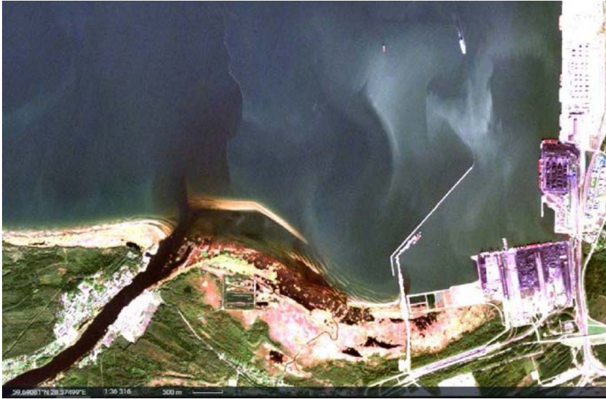
Fig. 5. Enlarged space image of the Luga Bay at Ust-Luga seaport on 23/09/2020 visualized with Natural Color Application of LV.

The use of special satellite image visualization applications as part of the proposed GISS made it possible to clearly identify the washed-up areas. The best results were achieved with the use of NDWI Application of LV (figure 6).