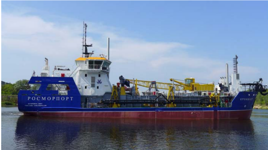
Fig. 7. Dredging vessel Kronshlot built in 2016.

We also established that dredging in the southern part of the seaport of Ust-Luga is expected to be carried out until the end of 2020, so increased turbidity in the Luga Bay will be observed further, until the end of these works. Note, discussion of the environmental consequences of the above-mentioned dredging operations in seaport of Ust-Luga is not task of this article.