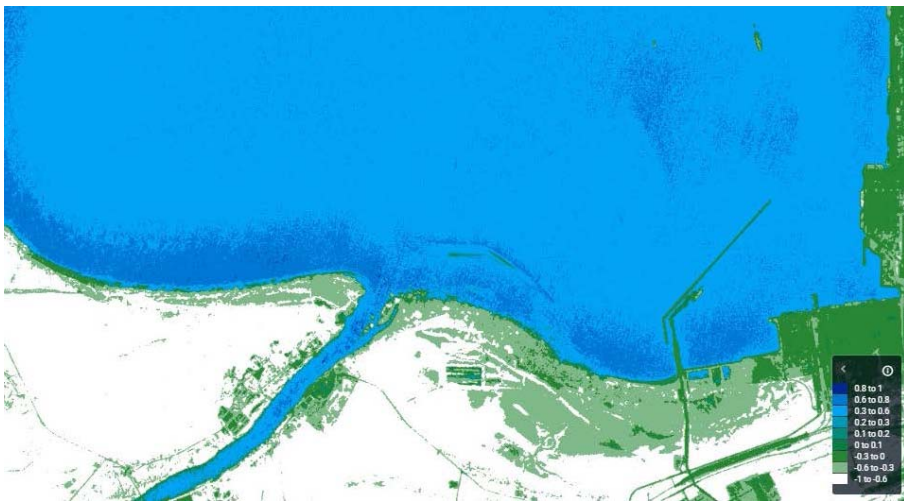
Fig. 6. Enlarged space image of the Luga Bay at Ust-Luga seaport on 23/09/2020 visualized with NDWI Application of LV.

The use of special satellite image visualization applications as part of the proposed GISS made it possible to clearly identify the washed-up areas. The best results were achieved with the use of NDWI Application of LV (figure 6).