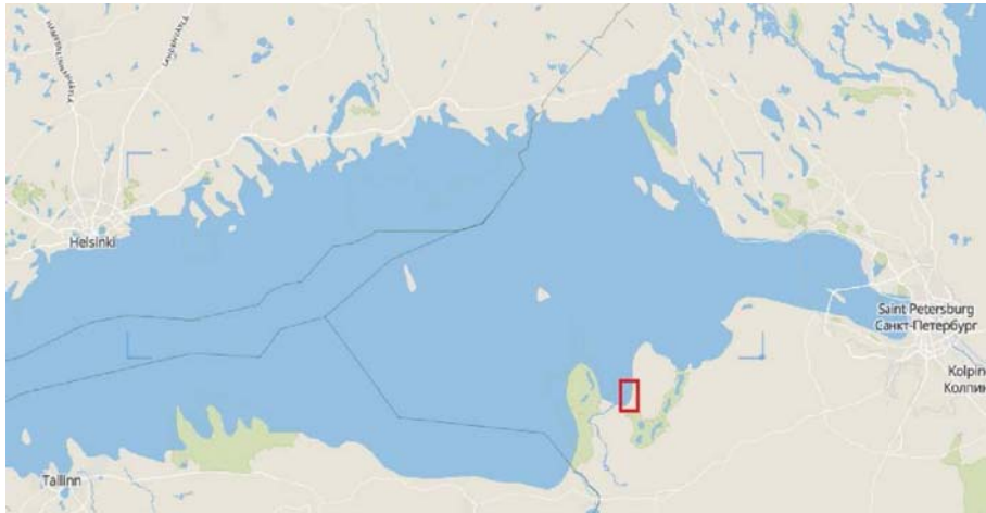
Fig. 1. General view of seaport Ust-Luga's location on the Gulf of Finland's map (red rectangle).