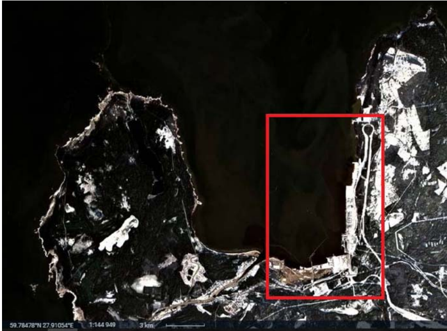
Fig. 3. Space image of the Luga Bay at Ust-Luga seaport on February 6, 2020, visualized with Natural Color Application of LV (red rectangular is Ust-Luga seaport area).