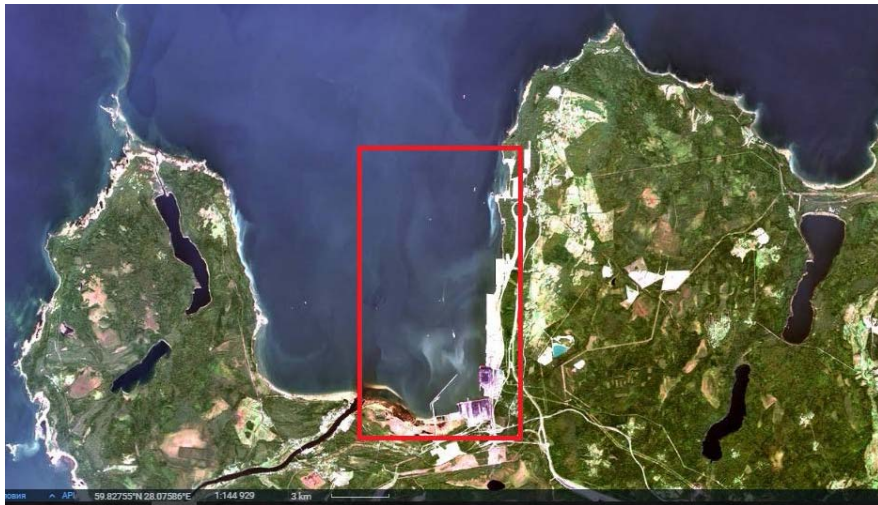
Fig. 4. Space image of the Luga Bay with Ust-Luga sea port on 23/09/2020 visualized with Natural Color Application of LV (red rectangular is Ust-Luga seaport area).