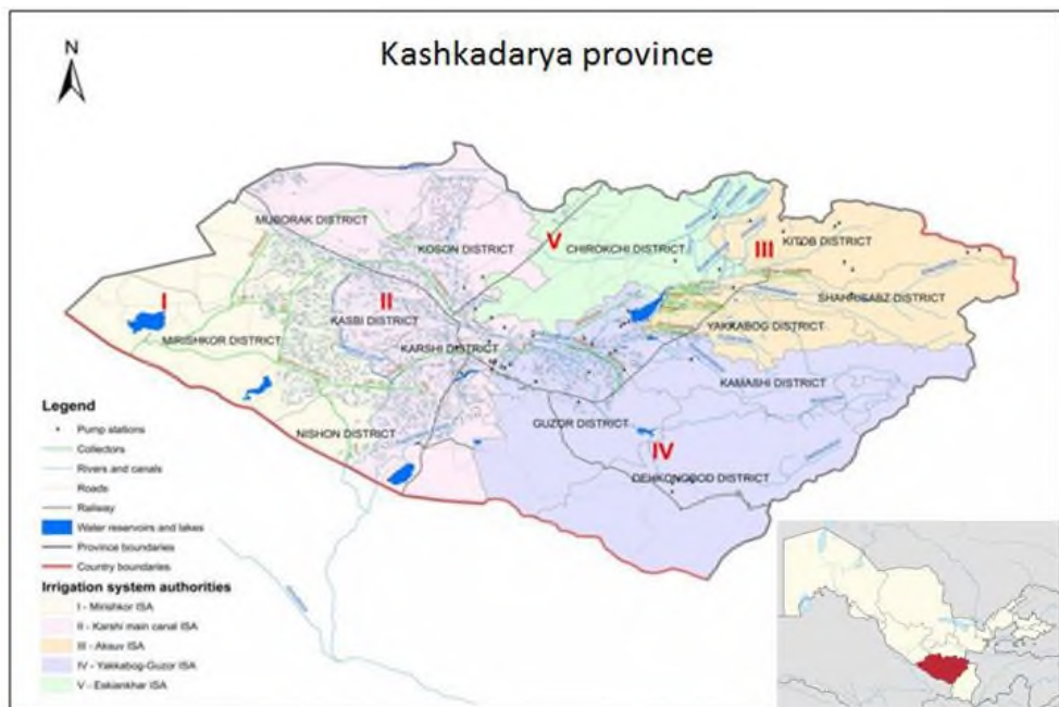
Fig. 1. A spatial location of the study area.

As the study area, irrigated saline soils of Kashkadarya province at different levels (non-saline, weak and moderate) (Fig. 1) were selected to examine the growing process of Bukhara-102 when mineral fertilizers were applied in different scales.