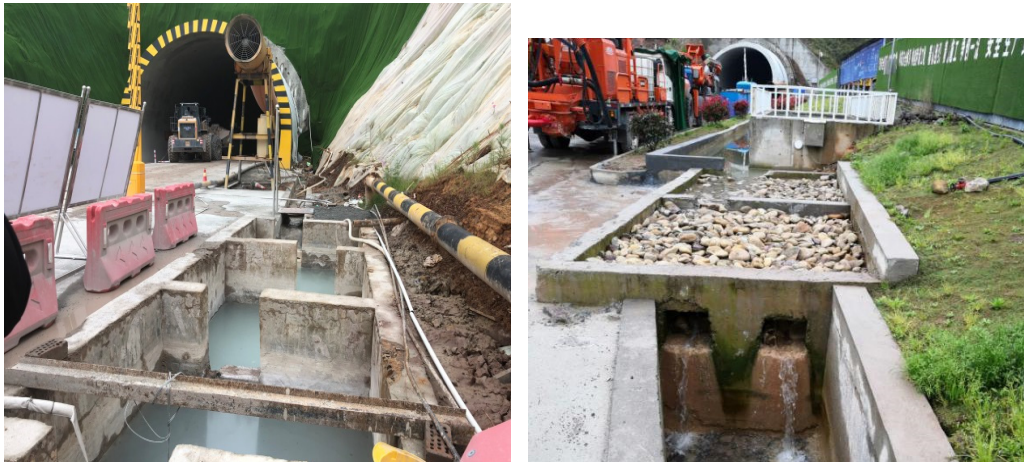
Figure 3 The sedimentation tank at the entrance and exit of the tunnel

be regularly removed, and the oil separating tank with high oil content shall be deoiled.