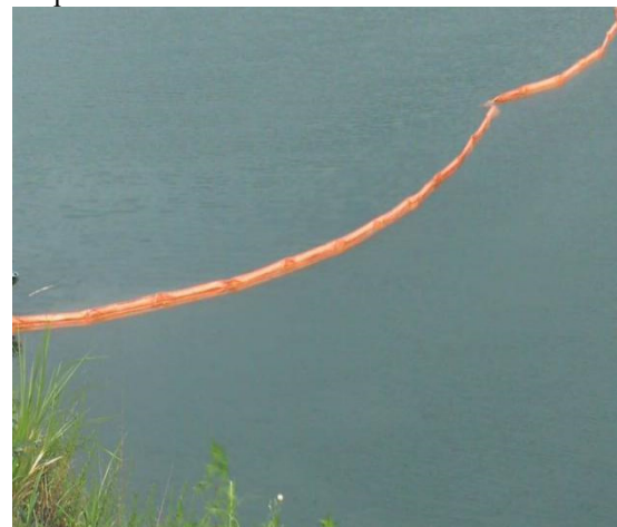
Figure 2 Oil fences

The mud circulation system is adopted for rapid separation of mud and slag and full circulation of mud. A mud-slag separation and circulation tank is arranged on the construction platform. The waste mud is collected and transported to the designated tank by a special mud truck, and then processed in a unified way after drying. The surrounding area is greened as well. No waste mud is allowed to be drained into the local urban pipe network and to pollute the local environment.