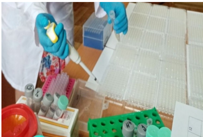
Fig. 2. Adding reagents to plates.