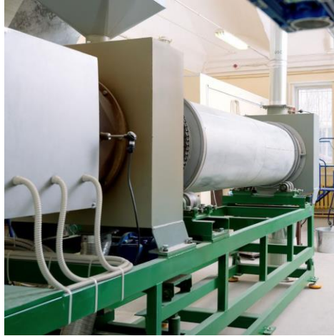
Fig. 1. General appearance of the pilot plant for the FGCG production:

material AFT – apatite flotation tailings from Kirovsk (Murmansk region). The chemical compositions of the siliceous components of the raw materials, are presented in Table 1.