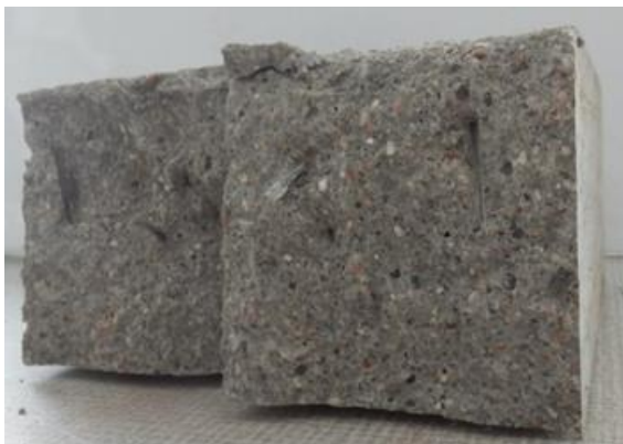
Fig. 4a Cross-section of the sample