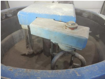
Fig. 1a Mixing of ingredients

The concrete mix was made in the Accredited Test Laboratory located at the Faculty of Civil Engineering at the Wrocław University of Technology. In the first stage all the components of the concrete mixture were mixed and then basalt fibers were added (figures 1a,1b). Then the ready mixture was placed in 100×100×500mm molds and stored until demoulding.