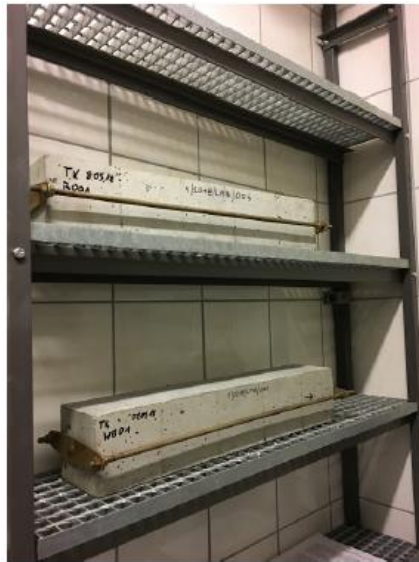
Fig. 3. Samples in a climatic chamber

After concreting, the molds with bars were placed in a climatic chamber with a temperature of 18 \pm 2^{\circ}\text{C} and a relative humidity of over 90%. The samples were demoulded 24 hours after concreting. Then the samples were stored in a climatic chamber at a temperature of 18 \pm 2^{\circ}\text{C} and a relative air humidity of 65-75%. The samples were stored in a way that allowed air to enter from all sides (Figure 3).