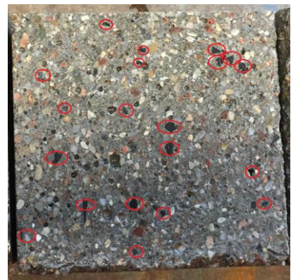
Fig. 4b Cross-section of the sample