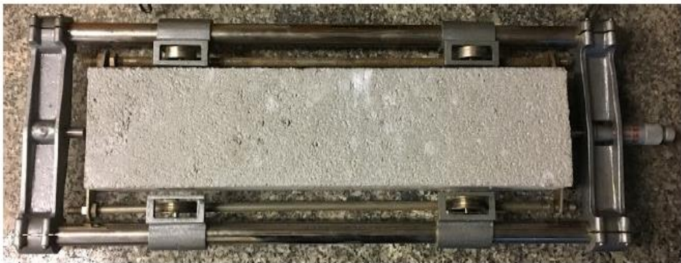
Fig. 2. Sample with measuring instrument

The sample shrinkage was tested on the basis of the PN-84: B-06714/23 standard. Determination of volumetric changes by the Amsler method. It consists the change in the length of the sample, determined with the Amsler apparatus, in relation to its initial length. The test was carried out on bars with dimensions of 100×100×500mm made by using aggregates with a grain size not greater than 16mm according to the recipe in tab 1.