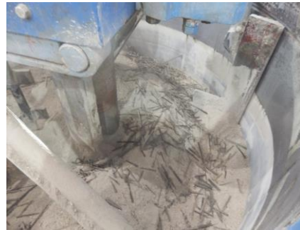
Fig. 1b Mixing of ingredients with basalt fibers

The sample shrinkage was tested on the basis of the PN-84: B-06714/23 standard. Determination of volumetric changes by the Amsler method. It consists the change in the length of the sample, determined with the Amsler apparatus, in relation to its initial length. The test was carried out on bars with dimensions of 100×100×500mm made by using aggregates with a grain size not greater than 16mm according to the recipe in tab 1.