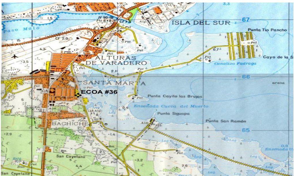
Fig. 2. Mapping of the area where the network of workshops is located in the Balearic of Varadero, Cuba.