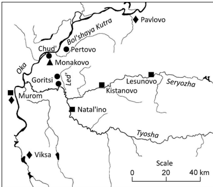
Fig. 1. Points of monitoring observations:

The meteorological station of the SIA Gidrotekhproekt was installed in the village of Monakovo at a distance about 2 km from the NPP site. The location of the meteorological site was chosen in compliance with the requirements of the national hydrometeorological service. When studying the climate of the NPP site vicinity area, data from the meteorological stations Murom, Pavlovo and Viksa were also used.