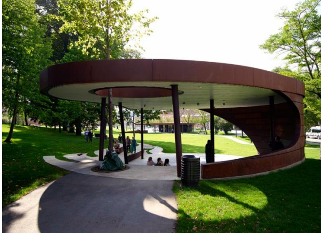
Fig. 2. Landscape architecture platform – shading zone in Maria Park in Vejle, Dutch. Landscape architect Bascon [22]

The creation of a variety of sunny, shady, sheltered subspaces has the potential to increase the use of open public spaces throughout the year. The shade is created using trees, fabric, wood or other material that makes it possible to reduce the temperature and active exposure to sunlight (Figure 2).