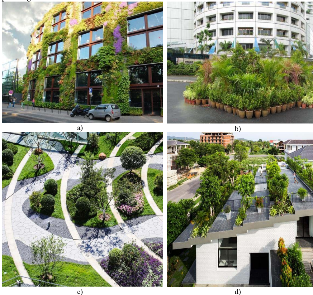
Fig. 1. The examples of city landscaping systems: a) vertical landscaping; b) portable landscaping systems; c) natural silhouettes; d) rooftop gardens.

Trees, shrubs, ground cover plants also add compositional diversity to the appearance of the streets and boulevards of the city and, in the case of coordinated interaction with architectural objects, can positively influence not only the artistic expressiveness of the urban environment, but also provide, first of all, adaptation measures as part of urban planning solutions.