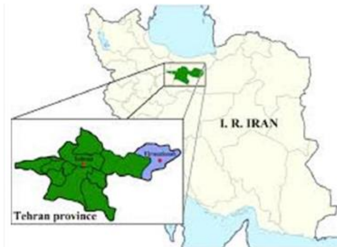
Fig. 1. Location of Tehran