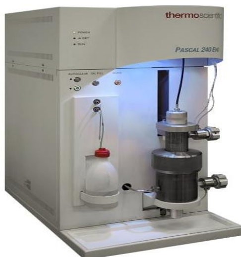
Fig.1. Thermo Scientific Pascal symbolic porosimeter

The study of the porous structure of aerated concrete blocks was performed using Thermo Scientific Pascal mercury porosimeter (Figure 1).