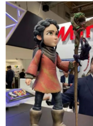
Figure 6. 3D color printing model.

Based on its unique advanced UV inkjet printing technology, Japan Mimaki launched the 3DUJ-553 full-color 3D printer in 2017, which is the world's first 3D printer that provides more than 10 million colors. The 3D color printing model is shown in Figure 6.