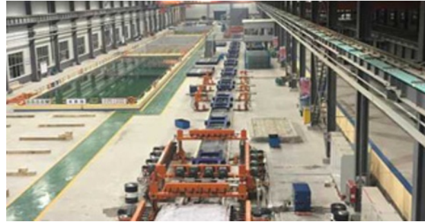
Figure 2. Unit flow method.