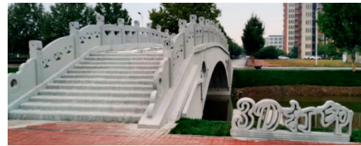
Figure 5. Concrete 3D printing Zhaozhou Bridge.

3D printing technology, also known as additive manufacturing technology. The typical application in the field of civil engineering is the concrete 3D printed arch bridge, as shown in Figure 5. The prefabricated concrete 3D printed Zhaozhou Bridge draws on the construction experience of the built 3D printed buildings, and introduces BIM virtual simulation technology and modern intelligent monitoring methods.[8]