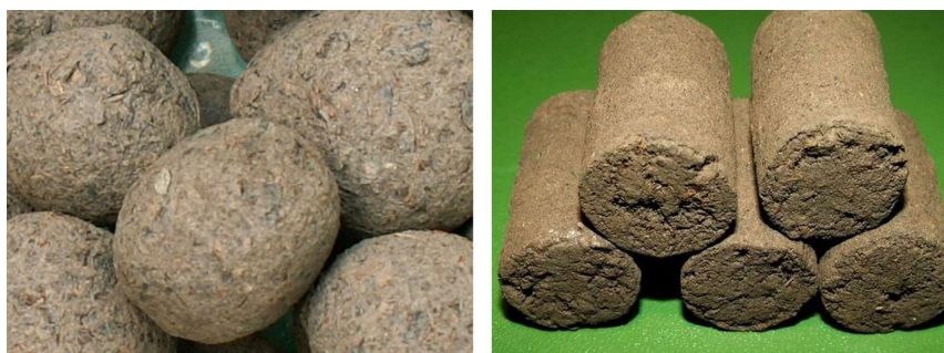
Fig. 2. Peat-based formed products: spherical (left) and cylindrical (right) pellets.

For the energy-related use of resources of peat deposits it is proposed to produce composite formed solid fuel or raw material for pyrolysis (gasification). The study of moisture content distribution in the formation of peat-mass (one of the initial stages of solid fuel production) depending on the average diameter of the pellets (Fig. 2) revealed a tendency to increase the initial moisture content when increasing their diameter. The increased moisture content in the pellets is determined by thicker hydrate films formed between the particles of the solid phase of the material.