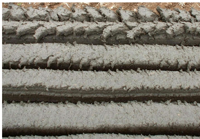
Fig. 4. Freshly-formed peat belt with obvious signs of annular «ruffling» (top).

It should be noted that the violation of integrity during the formation of a peat lump (pellet) has always been a fairly significant problem for the technology of peat production [15, 16]. Nowadays this problem is still relevant for the milling method of peat lump formation in the field: when forming peat with reduced moisture content (layer-by-layer or fine-slot milling), the lumps will have transverse cracks or even break when coming out of the nozzles. The reasons for this are the lack of water for the formation of water films, which bind the peat structure through capillary forces, and the high content of the gas phase, which separates the structural formations. As a result, such peat, which deforms intensively during its passage through the forming unit channel, expands after leaving it and forms transverse cracks and signs of annular «ruffling» (Fig. 4).