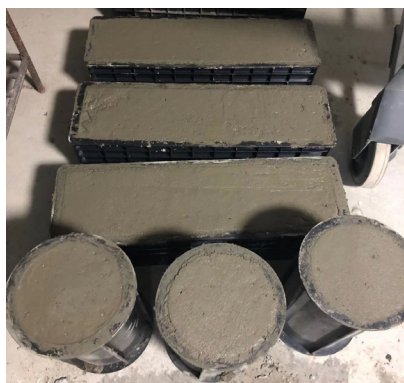
Fig. 1 Experimental process