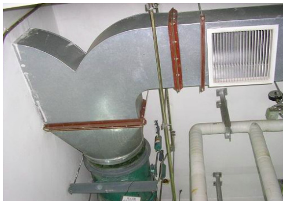
Figure 2. Noise in building HVAC engineering

the cost of subsequent maintenance. Therefore, the personnel involved in the design and construction should pay close attention to the noise and vibration of the building's HVAC system [2].