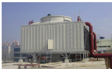
Figure 3. Low noise cooling tower

At present, people do not pay special attention to noise and vibration when designing heating, ventilation and air-conditioning systems. This problem is only discovered when the building is completed and reconstruction has a significant impact on the environment [6]. Therefore, designers must better understand the noise and vibration in the HVAC design process, formulate effective prevention and control plans to prevent excessive vibration and noise, and strictly abide by the rules related to HVAC building design to improve HVAC design.