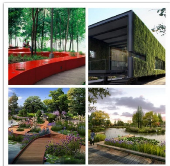
Fig. 1. Domestic ecological landscape design diagram

markers, barge boundaries, public areas and so on. The urban waterfront landscape is a kind of landscape, mostly distributed along the water in a linear or ribbon shape, which has unique natural characteristics from the morphological point of view, and it is also an important ecological corridor in the city.