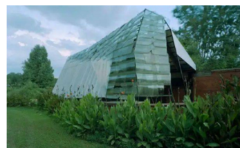
Fig. 4. Reuse of waste construction materials