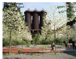
Fig. 3. Renovation of old buildings

Discarded construction materials can be restored and then re-displayed to present a unique landscape with historical significance or treated as part of a new material language so that they can be fully integrated into the site, as shown in Figure 4.