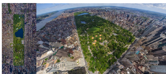
Fig. 2. Large ecological patches in New York's Central Park

area. At the regional scale, large ecological patches are the only areas that have a complete landscape structure and retain rich vegetation, sufficient corridors to protect water bodies, maintain biodiversity within the patch, and provide habitat for vertebrates, as shown in Figure 2. The different types of patch can be spatially random, homogeneous or clustered, with the patch form being influenced by local topography and climatic conditions, slope and wind relationships; corridors have a more distinct spatial character within the land complex, partly linking different elements of the landscape and partly separating some other different elements of the landscape to form a whole. Its structure and function are closely related to the degree of connectivity within the landscape area, and it is a narrow-shaped strip of space, mainly including vegetation corridors, river and valley corridors and transport corridors, etc. The formation of corridors is influenced by topography, climate and vegetation distribution; the spatial form of the matrix depends on the distribution of patches and corridors within it, and its characteristics largely govern the direction of development and the choice of management measures for the whole area.