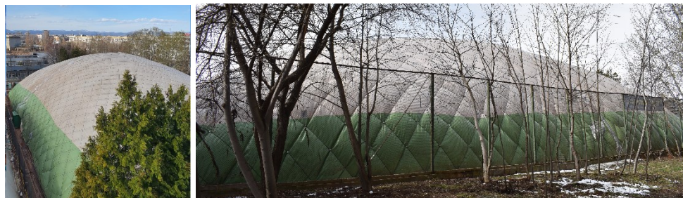
Fig. 1. Air supported dome for indoor tennis at UCTM.

The ASD for indoor tennis cover 3 tennis courts on the territory of University of Chemical Technology and Metallurgy (UCTM) in Sofia (fig. 1 and 2). Parameters of the structure are given in Table 1. The wall area is obtained based on the geometrical model of the construction (fig. 2). It is overestimated with 5 % for the thermal losses computation to reflect the surface relief, obvious from fig. 1.