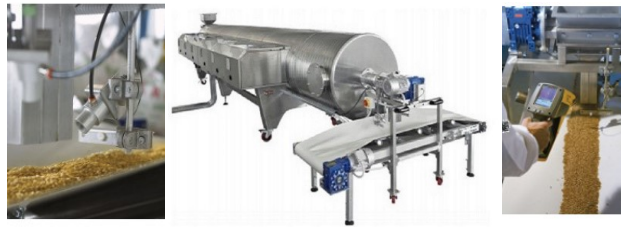
Fig. 6. The system MISYA AH-36-T [16]

The device has a maximum production capacity of 800 kg / hour with a power of 36 kW. All process parameters (temperature, power, speed) are constantly monitored using a PLC-based electronic control and management system.