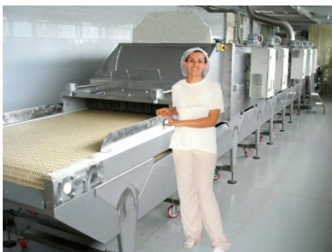
Fig. 2. System used for drying sweets and vegetable products [15]

In this regard, figure 2 presents a system used for drying sweets and vegetable products.