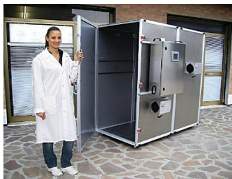
Fig. 4. Mobile treatment system [15]

The company also produces detachable microwave chambers, made to facilitate transport and treatment at the place of using. Their power varies from 3 to 12 kW. Figure 4 presents the mobile treatment system.