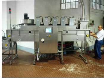
Fig. 3. The system for pasteurizing packed and unpacked products [15]

The company also produces detachable microwave chambers, made to facilitate transport and treatment at the place of using. Their power varies from 3 to 12 kW. Figure 4 presents the mobile treatment system.