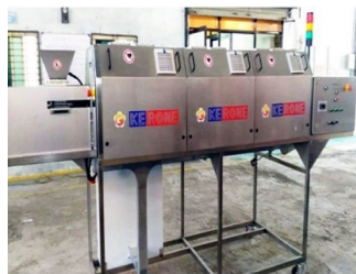
Fig. 7. Microwave treatment system for various applications [17]

Kerone (India) is a company that sells microwave installations, which can be used for blanching, pasteurization-sterilization, defrosting and drying. Figure 7 presents the microwave treatment system for various applications.