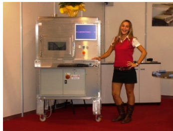
Fig. 5. Laboratory research system [15]

For laboratory research use, special microwave ovens are sold, having the temperature controlled by an infrared thermometer. The power varies from 1 to 6 kW. Figure 5 presents the laboratory research system.